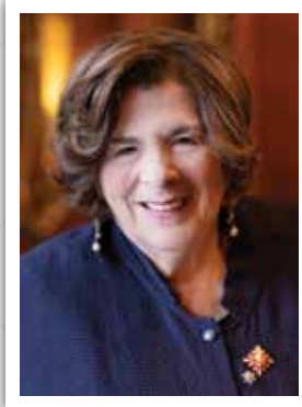
HER HONOUR THE HONOURABLE ANITA R. NEVILLE, P.C., O.M.

Anita R. Neville was installed as Manitoba's 26th Lieutenant Governor on October 24, 2022.